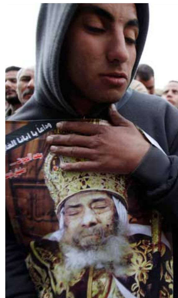
COPTICS MOURN. Egyptian Christians mourn during the funeral of Pope Shenouda III, the head of Egypt's Coptic Orthodox Church, at the Abassiya Cathedral March 20 in Cairo. Thousands of mourners gathered in Cairo for the funeral.