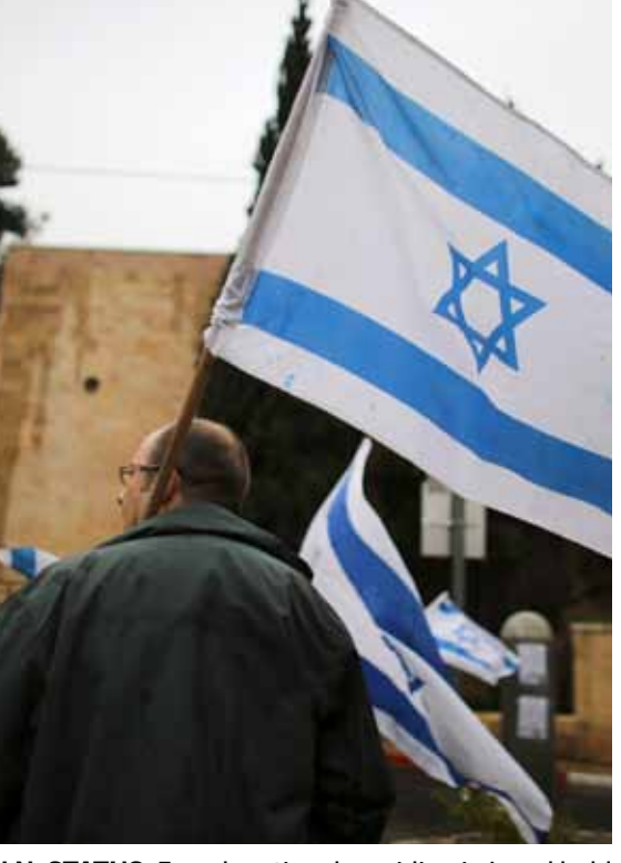
U.N. STATUS. French nationals residing in Israel hold flags as they protest outside the French Consulate in Jerusalem against France's support of a resolution that changed the Palestinian Authority's observer status at the United Nations to 'non-member state' and against its condemnation of a plan by Israel to expand settlements in the occupied West Bank and East Jerusalem on Dec. 5. Israel moved forward with plans to build some 3,000 settler homes in one of the most sensitive areas of the occupied West Bank, in defiance of international protests.

ndia welcomed a new cardinal, while, elsewhere, Christian persecution came in various forms, as did violence; and abortion, contraception and euthanasia were matters of debate from Canada to the United Kingdom and the Philippines.