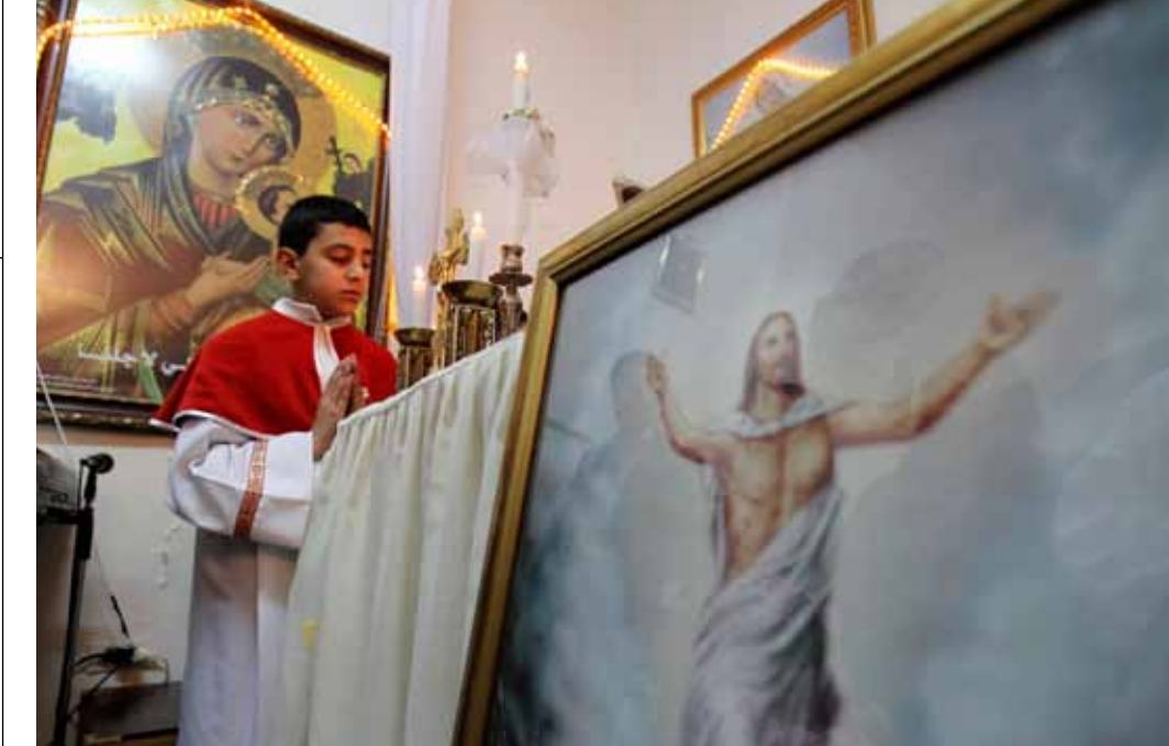
EASTER MASS. Iraqi Christians attend an Easter Mass at a Chaldean Catholic church in Amman on April 15. Thousands of Iraqi Christians fled to neighboring Jordan following a spate of bomb-