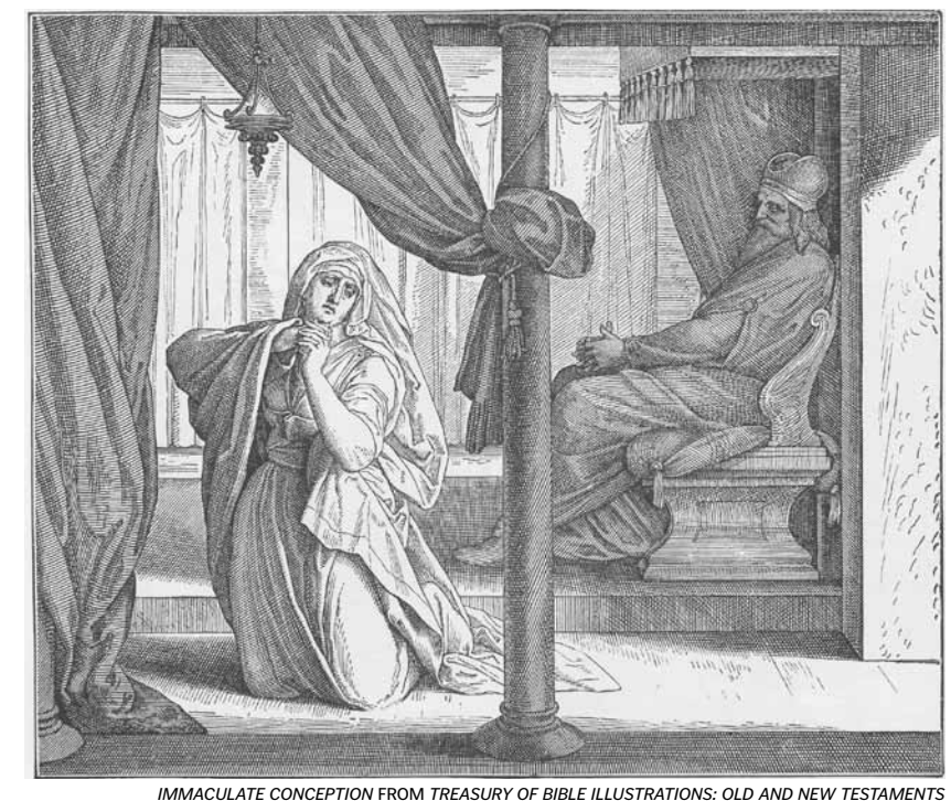
BY JULIUS SCHNORR VON CAROLSFELD, DOVER PUBLICATIONS, INC