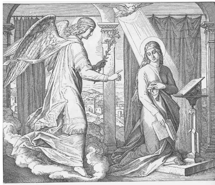
THE ANNUNCIATION FROM TREASURY OF BIBLE ILLUSTRATIONS: OLD AND NEW TESTAMENTS BY JULIUS SCHNORR VON CAROLSFELD, DOVER PUBLICATIONS, INC

God, almighty Father, when Mary surrendered herself to your word, she conceived Christ first in her mind through faith, in her heart through hope and love, and finally in her body through the marvelous operation of your Holy Spirit. By her eagerness to be the mother of your Son, she opened the floodgates of your merciful love for all men and women. May she help all people to live by faith, hope, love and obedience to your will. May she remind us always that you want to bring salvation to our brothers and sisters through our faith and good works. Help us to accept fully our responsibility to combat the culture of death and foster the culture of life in our American society. We ask this through Christ our Lord. Amen.