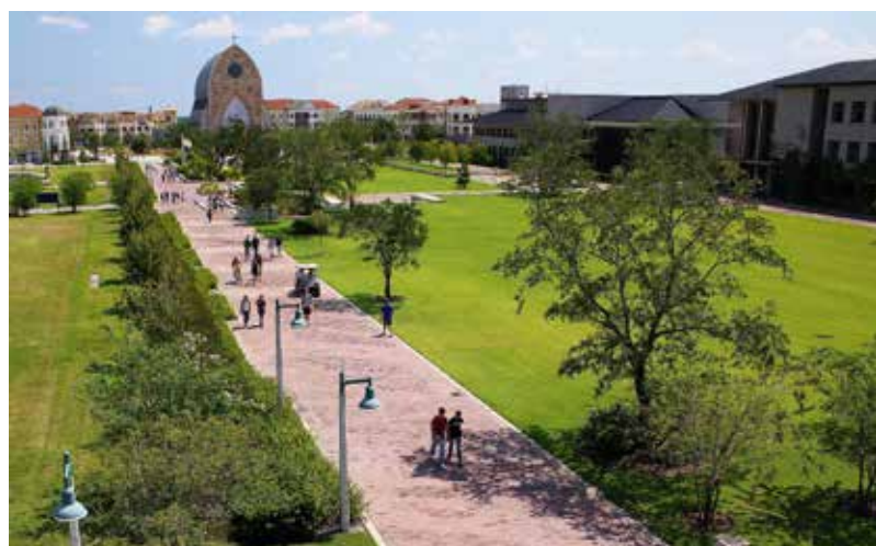
AVE MARIA UNIVERSITY

School's Comments: Mandatum & Theologians' Oath: Since our theology faculty are primarily adjunct, the mandatum is taken in the diocese of their full-time employment. Culture: CDU is an online university.