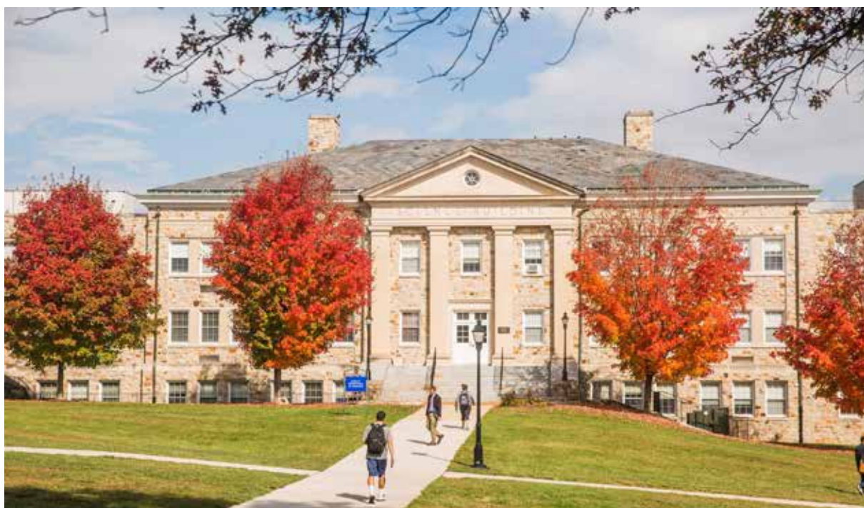
MOUNT ST. MARY'S

and for religious at both the further education and higher-education levels by offering courses in theology, catechesis and philosophy. It is based in the historic Maryvale House, which has been a center of Catholic faith, worship and spirituality for more than 400 years, and it was the first home of Blessed John Henry Newman following his reception into the Catholic Church. Maryvale offers ecclesiastical degree programs validated by the Pontifical Faculty of Notre-Dame, Paris, as well as undergraduate, postgraduate and research degrees through the Open University and Liverpool Hope University in England. Culture: Maryvale is part time and distance learning. Students only attend a maximum three times a year, mostly on weekends, for residential study periods and they stay in single study/bedrooms, not dorms. Health services are not provided.