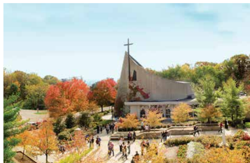
FRANCISCAN UNIVERSITY OF STEUBENVILLE