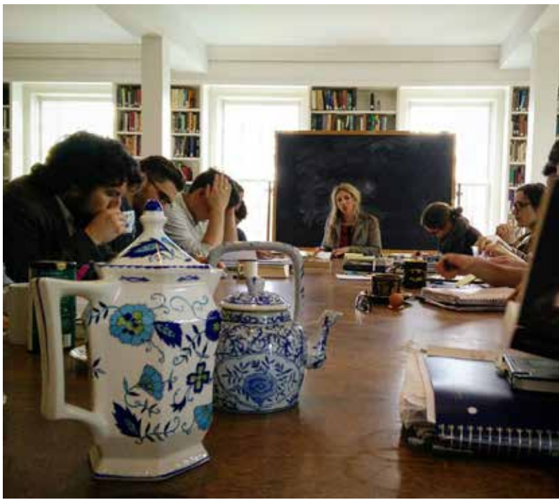
THOMAS MORE COLLEGE OF LIBERAL ARTS

School's Comments: Institution: The school offers a Master of Arts in theology, plus undergraduate certificate programs and summer-resident programs for religious. Mandatum: Theology professors (undergraduate and graduate) take the "Oath of Fidelity" and make the "Profession of Faith" publicly before the archbishop and receive the mandatum .