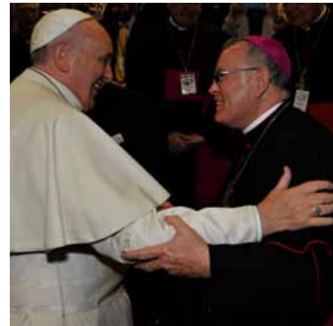
FAMILY-FRIENDLY PHILLY. Archbishop Charles Chaput of Philadelphia, the host city for the 2015 World Meeting of Families, was pleased that Pope Francis announced in November that he will make the trip for the September gathering.