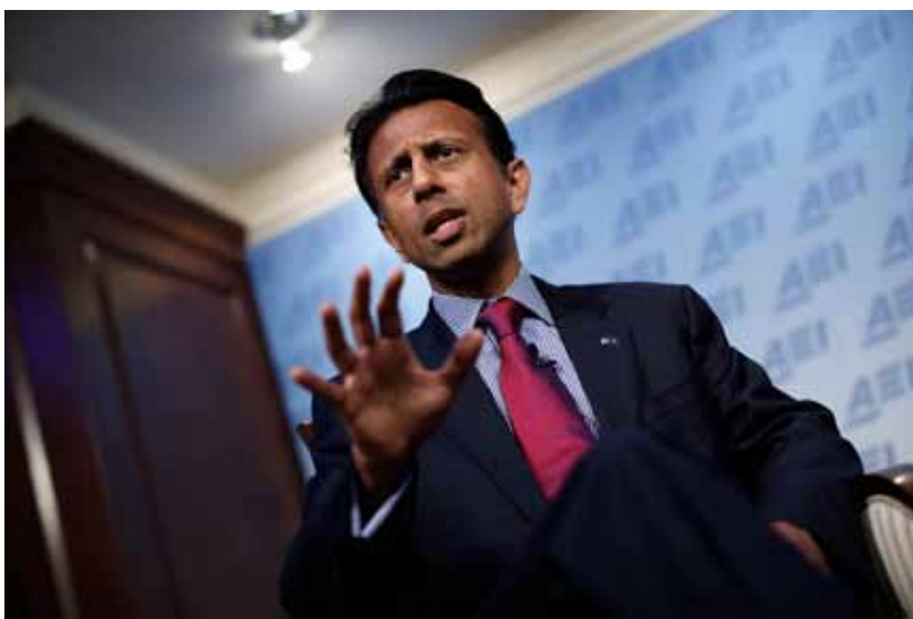
PROBLEMS AT THE CORE. Although Louisiana Gov. Bobby Jindal's battle against Common Core education standards lost ground when a court lifted his suspension on the standards in August, Catholic advocates for education reform praised the governor for his efforts.

Pro-Life Gains in Congress, Marriage Loses Ground, and Immigration Reform Remains Thorny Issue