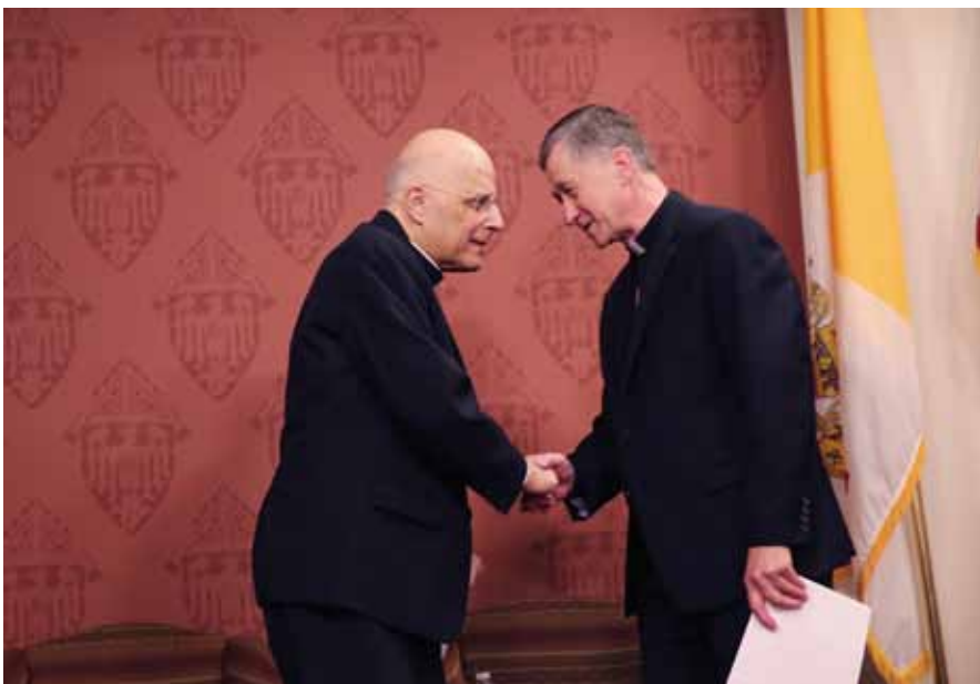
PASSING THE BATON. Archbishop-elect Blase Cupich (r) greets Cardinal Francis George, archbishop of Chicago, during a press conference in September that named the Spokane bishop to succeed Cardinal George in the City of Big Shoulders. Archbishop Cupich was installed at a Nov. 18 Mass in Chicago.