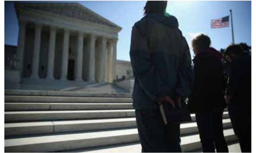
ANOTHER LINK IN THE CHAIN. Protesters pray in front of the U.S. Supreme Court on Oct. 6, the day the court announced that it would not hear pending same-sex 'marriage' cases in Indiana, Oklahoma, Utah, Virginia and Wisconsin, paving the way for the redefinition of marriage in 11 more states. At the close of 2014, 34 states had adopted same-sex 'marriage.'