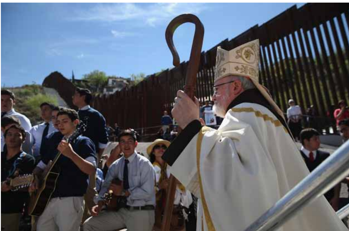
POLITICAL VOLLEYBALL. Cardinal Sean O'Malley (above), archbishop of Boston, arrives for Mass to pray for comprehensive immigration reform at the U.S.-Mexico border in Nogales, Ariz., in April. In November, President Barack Obama ignited a firestorm of criticism when he signed an executive order that provided temporary legal status to about 5 million immigrants residing in the United States without legal status. In July, the president angered people of faith when he signed another executive order that prohibits federal employers and contractors from discriminating against homosexual employees without offering a conscience exemption.