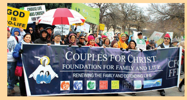
TOGETHER FOR LIFE. Couples for Christ participate in the Dallas Rally for Life at the Kay Bailey Hutchison Convention Center in Dallas on Jan. 16.

STOP SIGNS. High-school students from St. Agnes High School in St. Paul, Minn., attend the Minnesota March for Life at the Minnesota Capitol on Jan. 22.