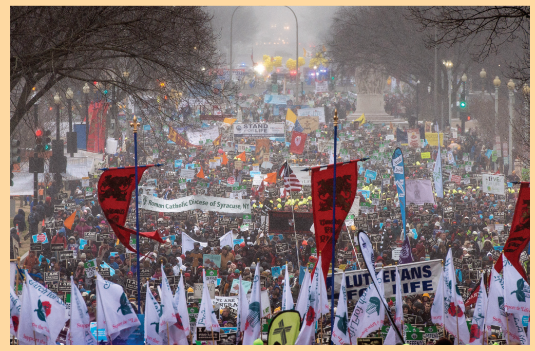
SNOWY MARCH. Thousands attend the March for Life in Washington Jan. 22, ahead of the historic snowfall, with signs and banners held high.

'ABORTION HURTS WOMEN.' Balloons herald a banner at Walk for Life West Coast in San Francisco on Jan. 23.