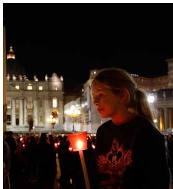
GOLDEN JUBILEE. A child attends a candlelight procession Oct. 11 in St. Peter's Square to mark the 50th anniversary of the Second Vatican Council. The Pope urged lapsed and lukewarm Catholics to rediscover their Church and stop the advance of 'spiritual desertification.' Pope Benedict opened the Year of Faith in Rome Oct. 11 with a call for a New Evangelization rooted in an authentic interpretation of the documents of the Second Vatican Council. He also issued a new reflection on the Council, recalling it as a 'moment of extraordinary expectation.' The Year of Faith runs through Nov. 24, 2013.