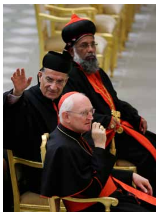
TALE OF TWO CONSISTORIES. Cardinals James Michael Harvey of the U.S. (bottom), Bechara Boutros Rai of Lebanon (c) and Basileios Cleemis Thottunkal of India sit before a special papal audience Nov. 26 after the second of two consistories. Archbishops Timothy Dolan of New York and Edwin O'Brien, grand master of the Equestrian Order of the Holy Sepulchre of Jerusalem, were among the 22 who were made cardinals on Feb. 18.