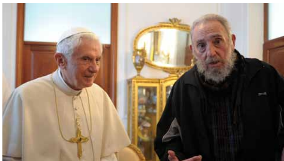
TRAVELS. Pope Benedict arrives for Mass in Plaza de la Revolución (below) March 28 in Havana, Cuba. From March 23-29, the Holy Father made the first of just two apostolic voyages outside Italy this year: to Mexico and Cuba. In Mexico, he urged the people to maintain their faith and continue to turn to the Virgin Mary in the face of violence and chaos caused by the country's deadly drug war. He then visited Cuba, saying the country needs change, but adding that it will only happen if citizens are able to freely seek truth, fraternity and reconciliation. The visit included a half-hour meeting with an ailing Fidel Castro. The Pope managed to persuade the Cuban government to re-introduce a public holiday on Good Friday. The Pope also traveled to Beirut, Lebanon, in September for a three-day visit. Despite a bloody war in Syria and riots across the Islamic world, the Pope visited to sign and deliver his apostolic exhortation on the Church in the Middle East that took place at the Vatican in October 2010. The Holy Father was largely greeted enthusiastically by Muslims and Christians in the country. He made impassioned pleas for peace, reconciliation and interreligious harmony in the region and appealed to Christians not to emigrate.