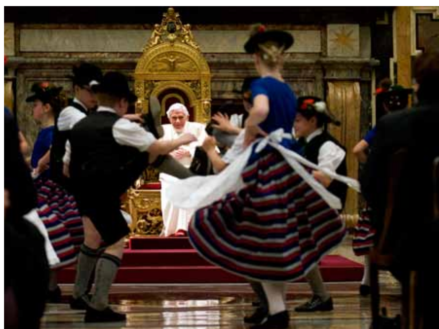
HAPPY BIRTHDAY! Children dressed in traditional Bavarian costumes dance for Pope Benedict XVI during the Holy Father's 85th birthday celebration in the Clementine Hall April 16.