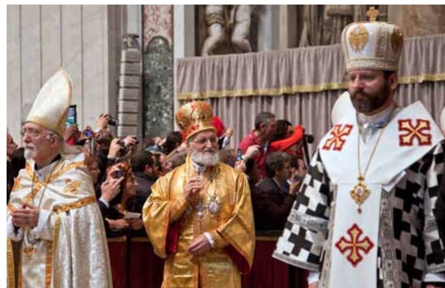
NEW EVANGELIZATION. Cardinals, bishops and patriarchs arrive in procession at St. Peter's Basilica to celebrate Mass for the closing of the Synod of Bishops Oct. 28. The establishment of a special Church commission to defend religious liberty, a pastoral document on how to encounter Jesus Christ and a new apologetics of Christian thought came out of the synod.

Oh, yes, the Holy Father also joined the millions of Twitter users, posting his first "tweet" Dec. 12 (see story on page 6).