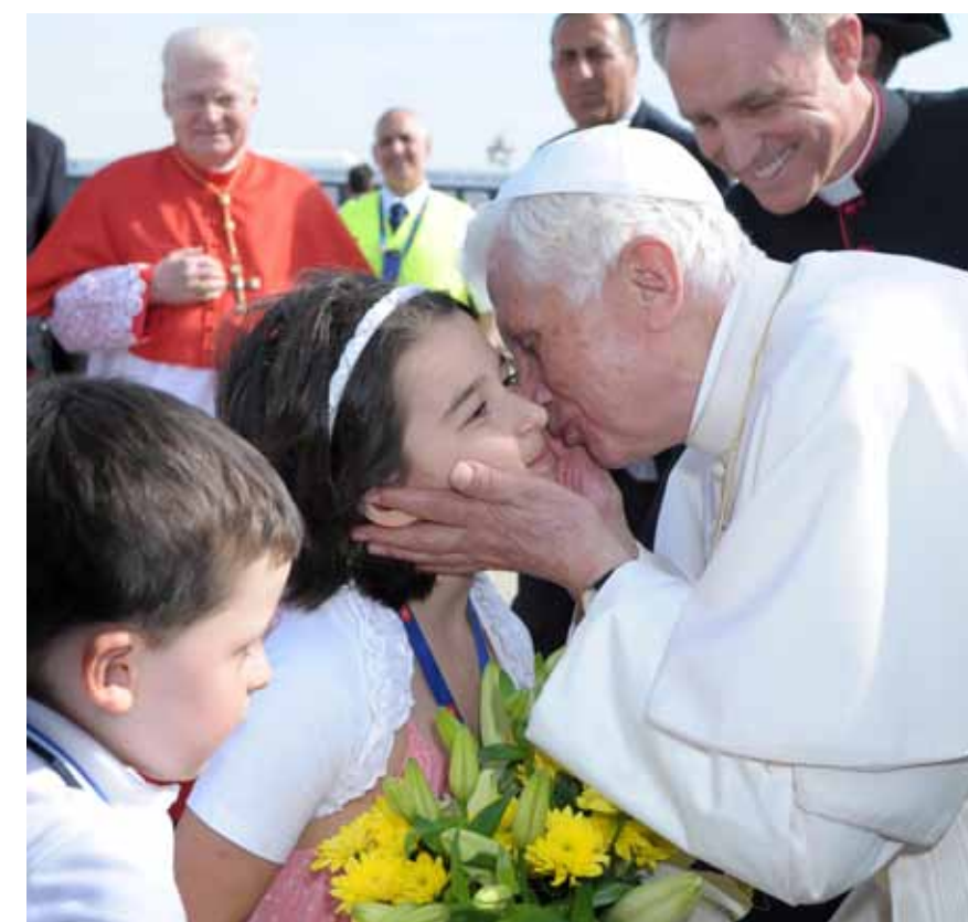
FAMILY AFFAIR. Pope Benedict XVI greets children at Linate Airport as he arrives to attend the 2012 World Meeting of Families on June 1 in Milan, Italy.