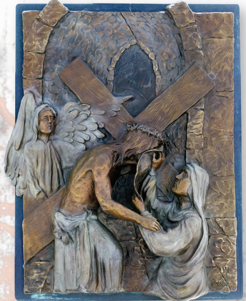
AT EACH STATION LEADER: The [number] Station of the Cross, [name the station]. We adore you, O Christ, and we bless you. ALL: Because by your holy cross you have redeemed the world!