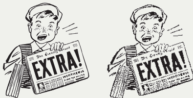
SCANNED AT 1200 DPI