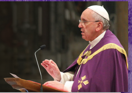
CATHOLIC NEWS AGENCY

The Register's clip-out, photocopy and pass-on guides for Advent