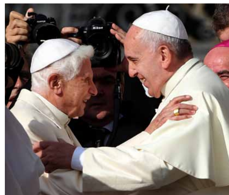
DEVOTED SERVANTS. Pope Francis greets Pope Emeritus Benedict XVI as he arrives at St. Peter's Basilica during a celebration for grandparents and the elderly on Sept. 28. Pope Francis celebrated Mass following a special encounter with elderly persons. In his homily, the Holy Father said, 'The elderly are key to the health of free society.'