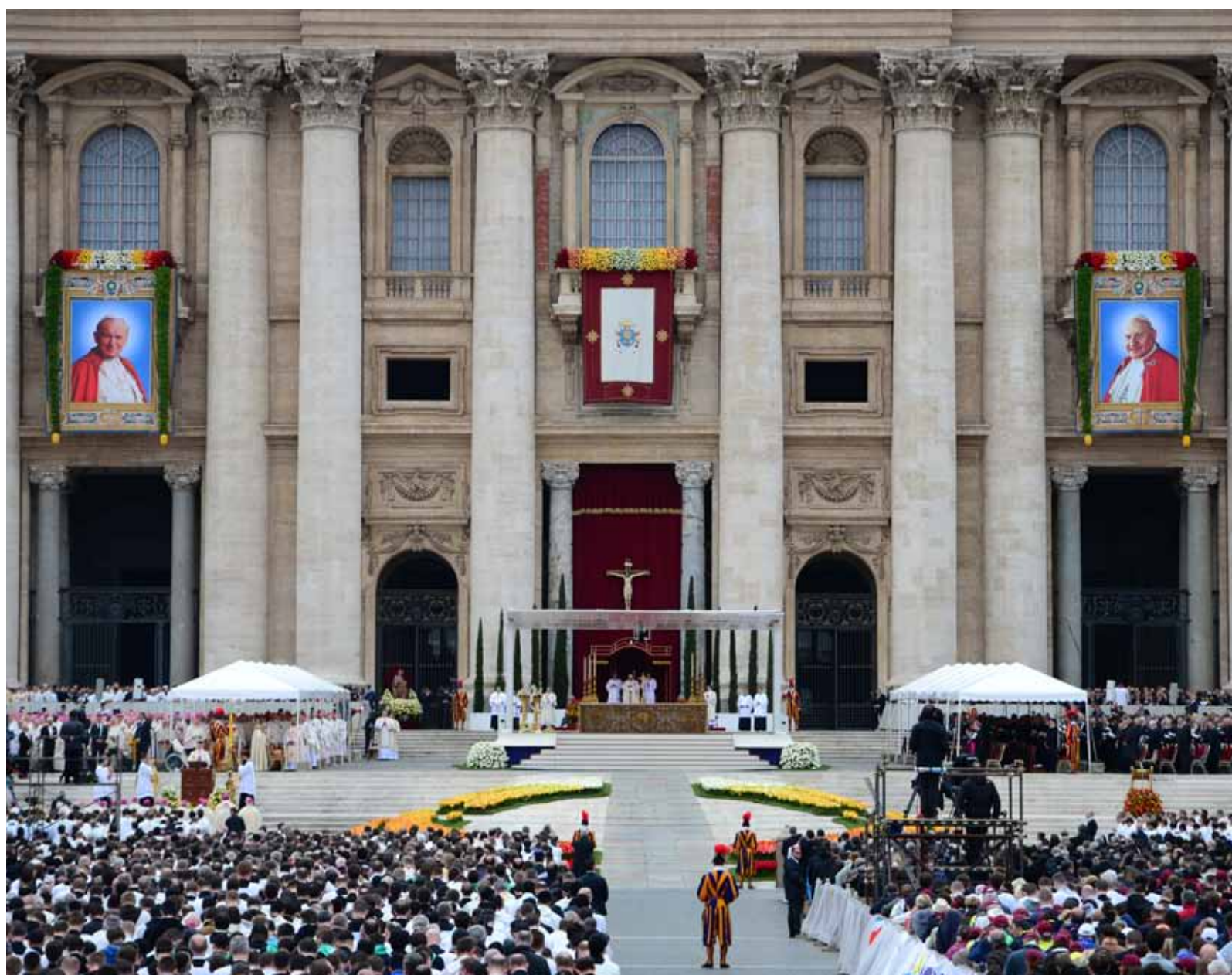
SANCTITY CELEBRATED. Pope Francis, with Pope Emeritus Benedict XVI in attendance, leads the canonization Mass for Sts. John Paul II and John XXIII on April 27 in St. Peter's Square. Dignitaries, heads of state and royalty from Europe and across the world attended the events.