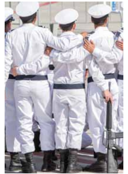
RELAXED MOMENT. Israeli soldiers pose for a photo before a welcome ceremony for Pope Francis at Ben Gurion International Airport on May 24.