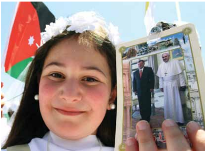
JORDANIAN PRIDE. A young girl holds a photo of Pope Francis and Jordan's King Abdullah II as Jordanians and Christians from various nationalities and denominations congregate at Amman's International Stadium to wait for Pope Francis to celebrate Mass on May 24.