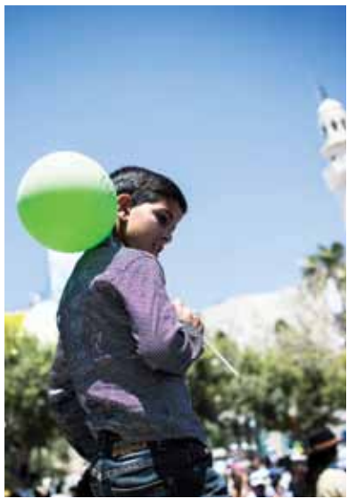
ANTICIPATION. A young boy holds a green balloon as he waits in Manger Square for Pope Francis to celebrate Mass on May 25 in Bethlehem, West Bank.

The festering divisions between Christians, he said, make "my heart sick." Yet, while kneeling in prayer with Patriarch Bartholomew before the tomb of Jesus, "we heard the strong voice of the Good Shepherd, of the Risen One who wants us to all be one."