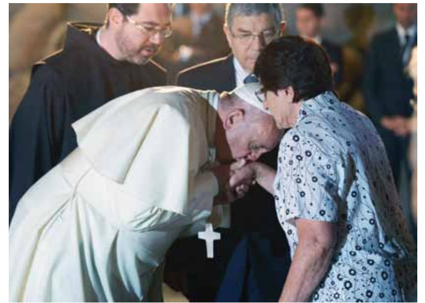
SOLIDARITY. At left, Pope Francis embraces Israeli President Shimon Peres upon his arrival at Ben Gurion International Airport. Above, the Holy Father kisses the hands of a Holocaust survivor May 26 during his visit to the Yad Vashem Holocaust Museum in Jerusalem.