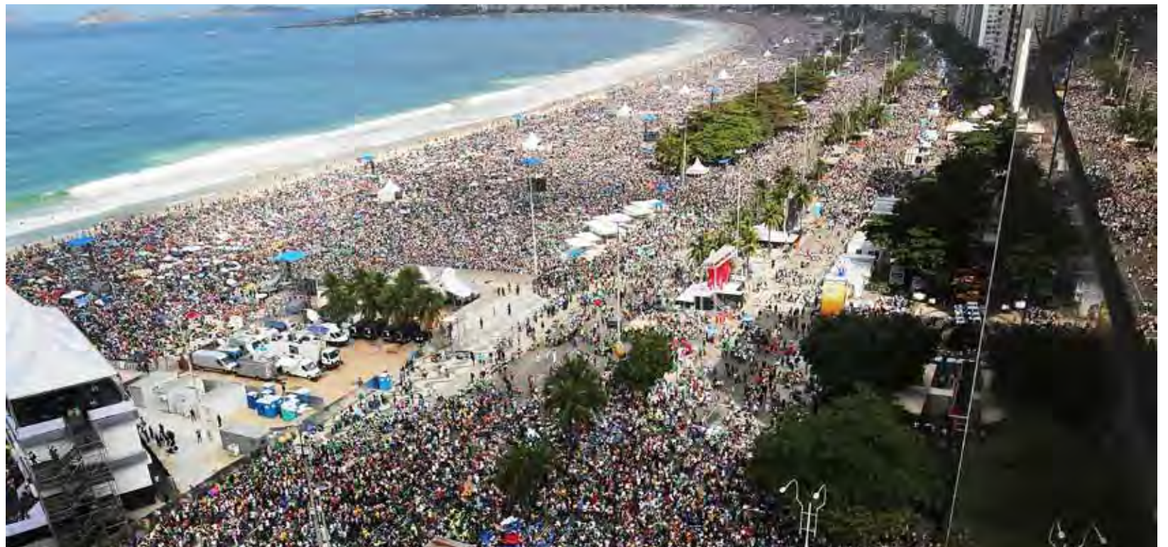
MEMORABLE RETURN. Pope Francis celebrates Mass on Copacabana Beach before an estimated 3 million pilgrims to close World Youth Day July 28.

www.HolyLandPilgrimages.org | 1-800-566-7499 info@holylandpilgrimages.org