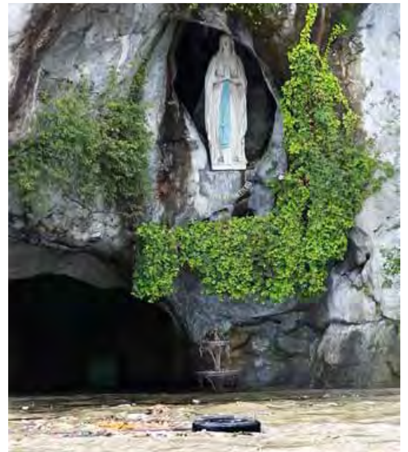
UNDER WATER. An automobile tire floats past the flooded grotto at the Marian shrine of Lourdes, southwestern France, June 19. Heavy rains forced the closure of the pilgrimage site and the evacuation of pilgrims from nearby hotels.