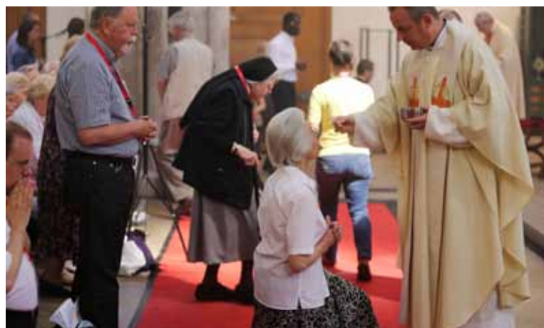
BODY OF CHRIST. Attendees of the Eucharistic Congress of Germany receive Communion at Mass. The gathering was held June 5-9 in Cologne, a previous site of World Youth Day.