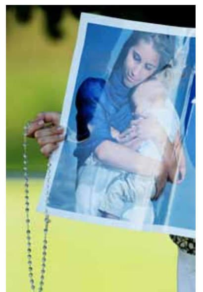
SAD DAY FOR THE IRISH. Pro-lifers pray the Rosary July 29. The next day, Ireland passed a law allowing abortion in cases where 'the life of the mother is at risk, including from suicide.'