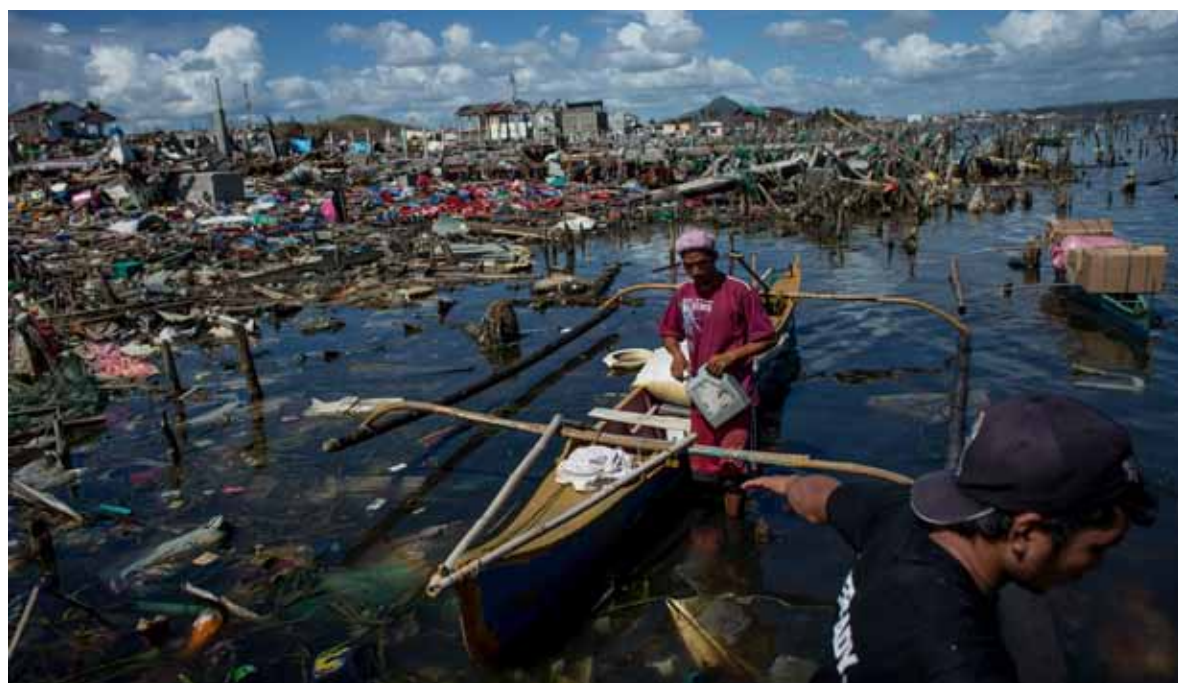
BRINGING AID. Men load food packages onto boats in Tacloban Nov. 18, following Typhoon Haiyan, which ripped through the Philippines in early November. It was one of the most powerful typhoons ever to hit land, leaving thousands dead and hundreds of thousands homeless.