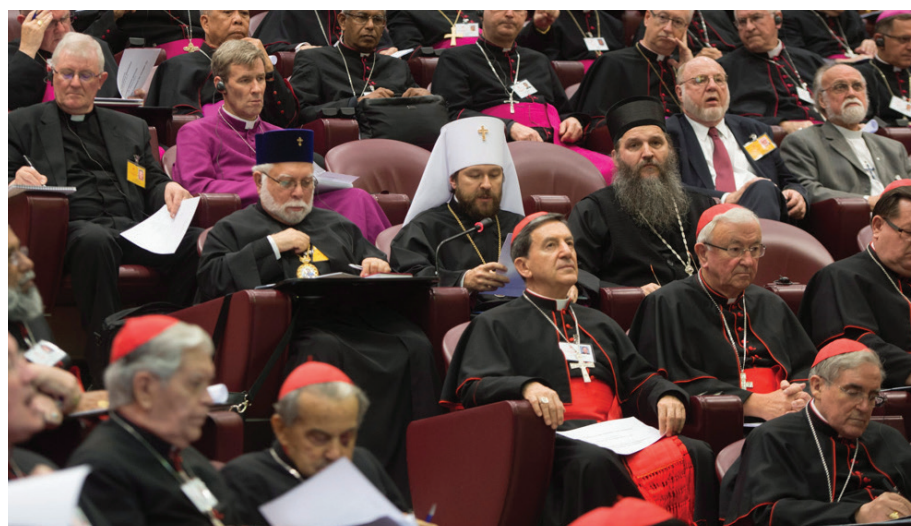
FRACTIOUS FORTNIGHT. Cardinals and bishops gather on Oct. 21 during the Ordinary Synod of Bishops on the Family. The majority of synod fathers sought to restore the stability of marriage and the family, while others seemingly sought to water down Church teaching in the name of charity.