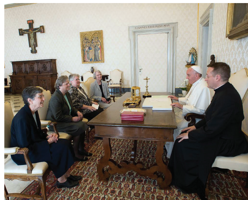
RESOLUTION REACHED. Pope Francis meets with the leaders of the Leadership Conference of Women Religious, which agreed to follow the reform procedures recommended by the Holy See, on April 16.