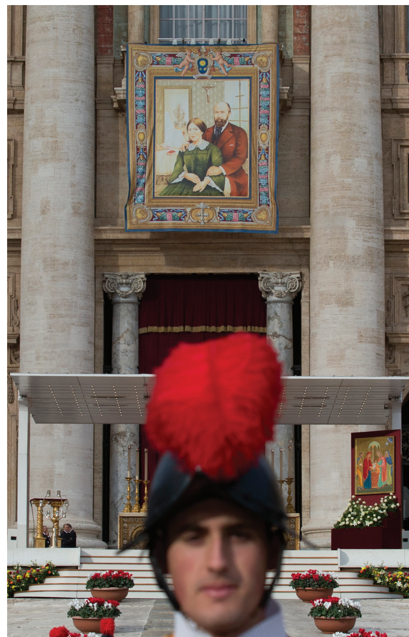
SAINTS FOR THE FAMILY. A tapestry showing Louis and Zélie Martin, parents of St. Thérèse of Lisieux, hangs from a balcony of St. Peter's Basilica at the Vatican on Oct. 18, when Pope Francis canonized the Catholic Church's first married couple in modern times.