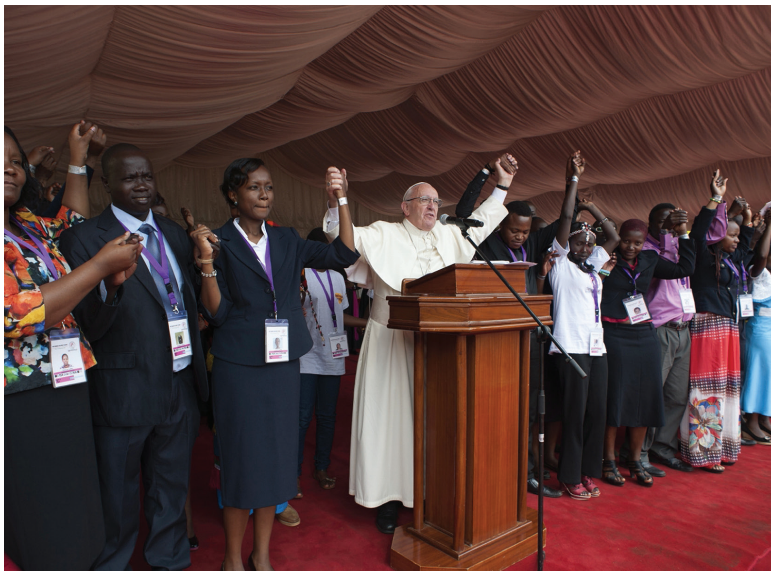
SHARING THE JOY OF THE GOSPEL. Pope Francis traveled to Kenya, Uganda and the Central African Republic in November, on a continent where Catholicism is rapidly spreading. Here, he meets with youth in Kassarani Stadium in Kenya on Nov. 27.