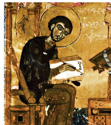
DOCTOR ON CALL. St. Gregory of Narek, the 10th-century Armenian monk and philosopher, was named the newest doctor of the Church on Feb. 21. He authored a mystical interpretation of Song of Songs, among his numerous poetic writings. His Book of Lamentations, written around 977, is another of his major works.