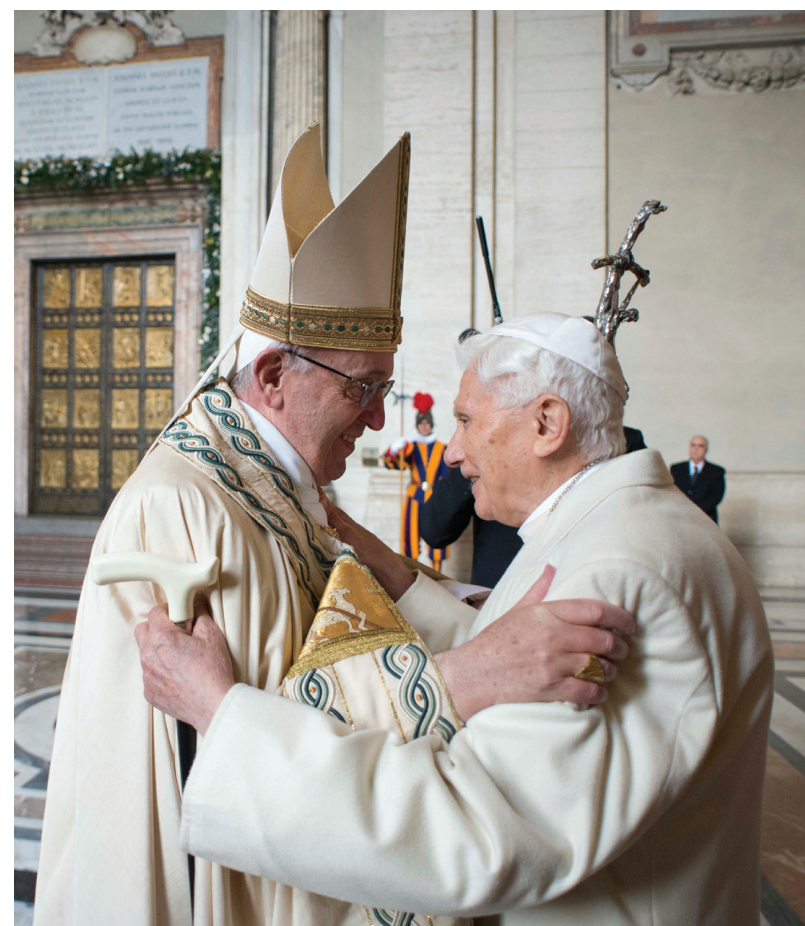
CONFRERES. Pope Francis embraced Pope Emeritus Benedict XVI outside of the holy doors at St. Peter's Basilica at the Dec. 8 ceremony that kicked off the Jubilee of Mercy.