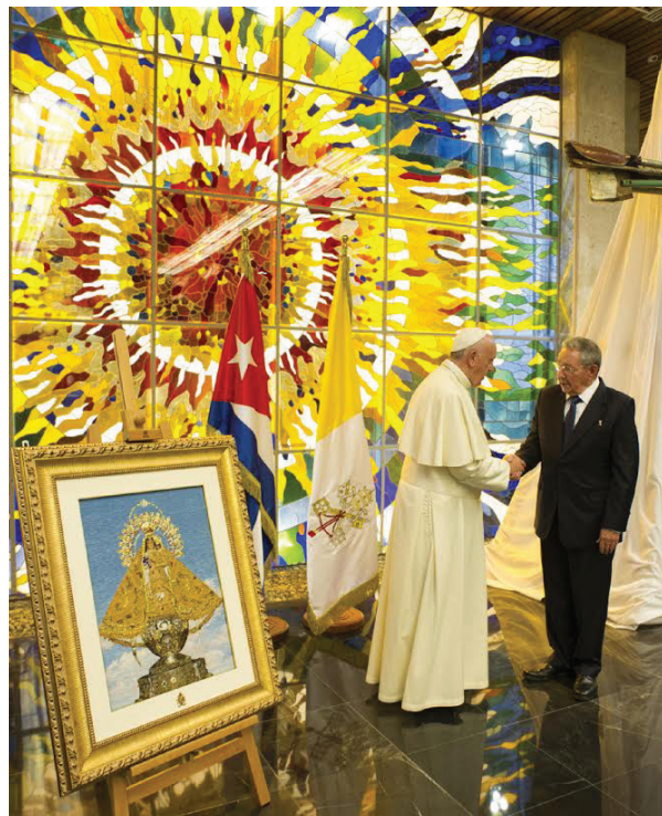
CUBAN CAULDRON. Pope Francis' visit to communist Cuba was a breath of fresh air in a country mired in economic and spiritual depression. Here, he meets with President Raul Castro at the Palace of the Revolution in Havana, Cuba, on Sept. 20.