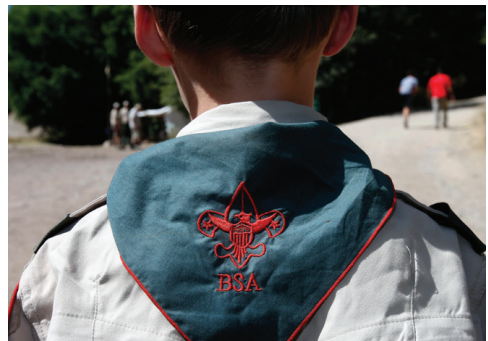
SCOUTING DEBATE. A boy scout listens to instruction at camp Maple Dell on July 31 outside Payson, Utah. The Mormon Church considered pulling out of its 102-year-old relationship with the Boy Scouts after the Boy Scouts changed its policy on allowing homosexual leaders in the organization. Over 99% of the Boy Scout troops in Utah are sponsored by the Mormon Church.