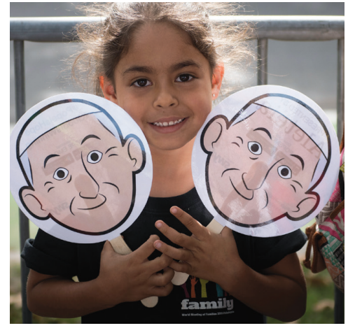
SPONTANEOUS POPE. At left, Pope Francis delivers a rousing, off-the-cuff speech on the Catholic family at the 'Festival of Families,' part of the World Meeting of Families in Philadelphia, on Sept. 26. Above, a young girl shows her affection for the Holy Father prior to his momentous arrival in New York.