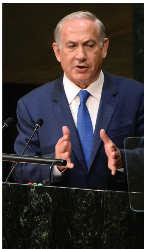
STERN WARNING. Benjamin Netanyahu, prime minister of Israel, speaking at the United Nations' General Assembly on Oct. 1 in New York City, fiercely criticized the nuclear agreement between the United States and Iran, warning that once the economic sanctions were lifted on Iran, it would become a more belligerent presence in the Middle East.

MISSIONARY-SAINT. The tapestry of St. Junipero Serra hangs from the facade of the Basilica of the Immaculate Conception in Washington on the occasion of his canonization Mass, celebrated by Pope Francis, Sept. 23.