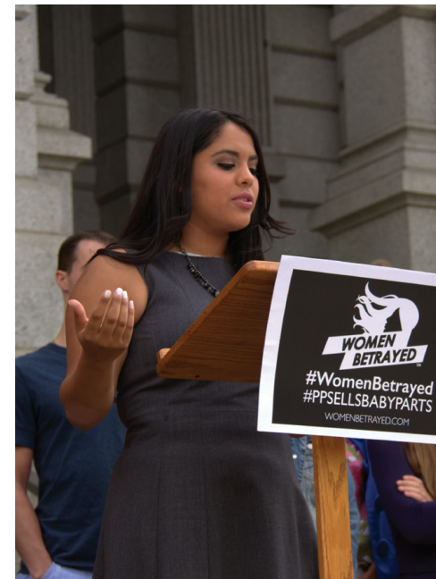
STANDING FOR WOMEN. Near left, a 'Women Betrayed' rally in front of the Denver State Capitol in Colorado on Aug. 18. The rally protested Planned Parenthood and called on state and federal officials to defund Planned Parenthood. Far left, a student-organized 'Women Betrayed' rally protested against Planned Parenthood in an effort to defund the organization on July 28 at the U.S. Capitol in Washington. Participants included Dr. Ben Carson and Sens. Rand Paul and James Lankford.

VIOLENCE. People create a memorial for victims at Emanuel AME Church on July 31 in Charleston, S.C. Earlier in the morning, Dylann Roof, the shooter in the June 17 massacre, was arraigned on 33 federal charges, including hate crimes. Sean Rayford/Getty Images