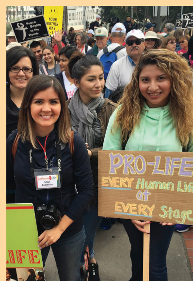
4 LIFE. Pro-lifers show their creativity for the cause at OneLife LA on Jan. 23.