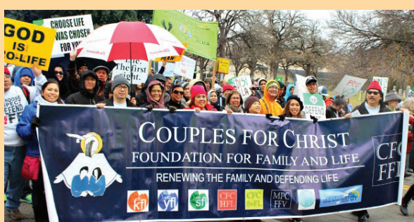
TOGETHER FOR LIFE. Couples for Christ participate in the Dallas Rally for Life at the Kay Bailey Hutchison Convention Center in Dallas on Jan. 16.

STOP SIGNS. High-school students from St. Agnes High School in St. Paul, Minn., attend the Minnesota March for Life at the Minnesota Capitol on Jan. 22.