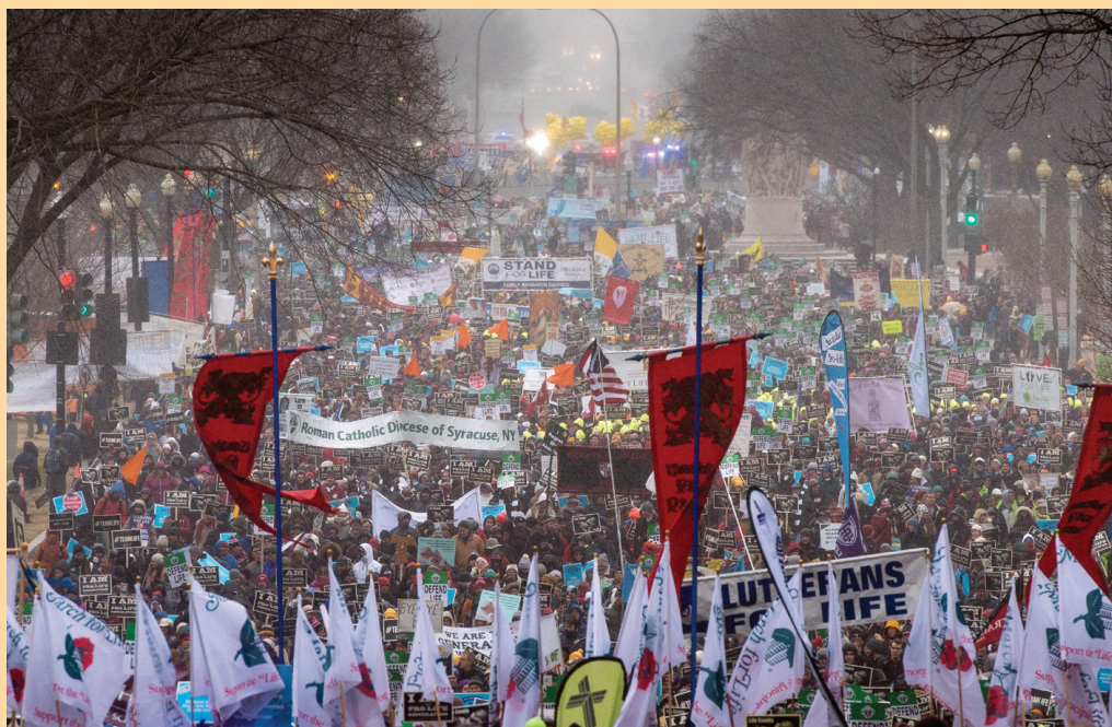
SNOWY MARCH. Thousands attend the March for Life in Washington Jan. 22, ahead of the historic snowfall, with signs and banners held high.

'ABORTION HURTS WOMEN.' Balloons herald a banner at Walk for Life West Coast in San Francisco on Jan. 23.