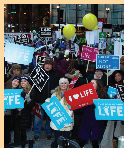
ILLINOIS 'HEARTS' LIFE. Signs show support for the unborn at March for Life Chicago on Jan. 17.